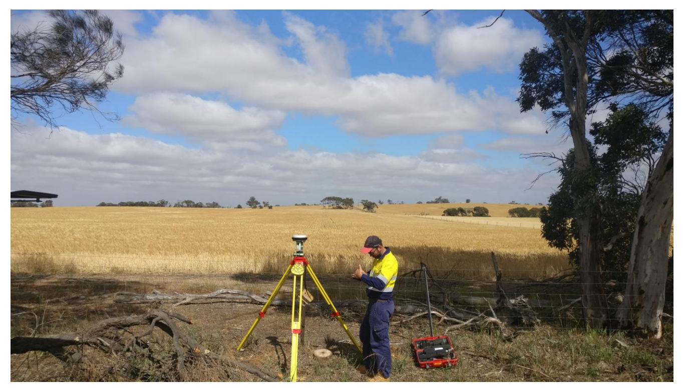
GNSS survey to improve regional geodetic network.

This document sets out four strategic priorities for Landgate to ensure the WA geodetic system is accurate, reliable, and relevant to its current and future users. Landgate will deliver these objectives with regard to broader government priorities and its stakeholders needs, and it will do it in the most economical way.